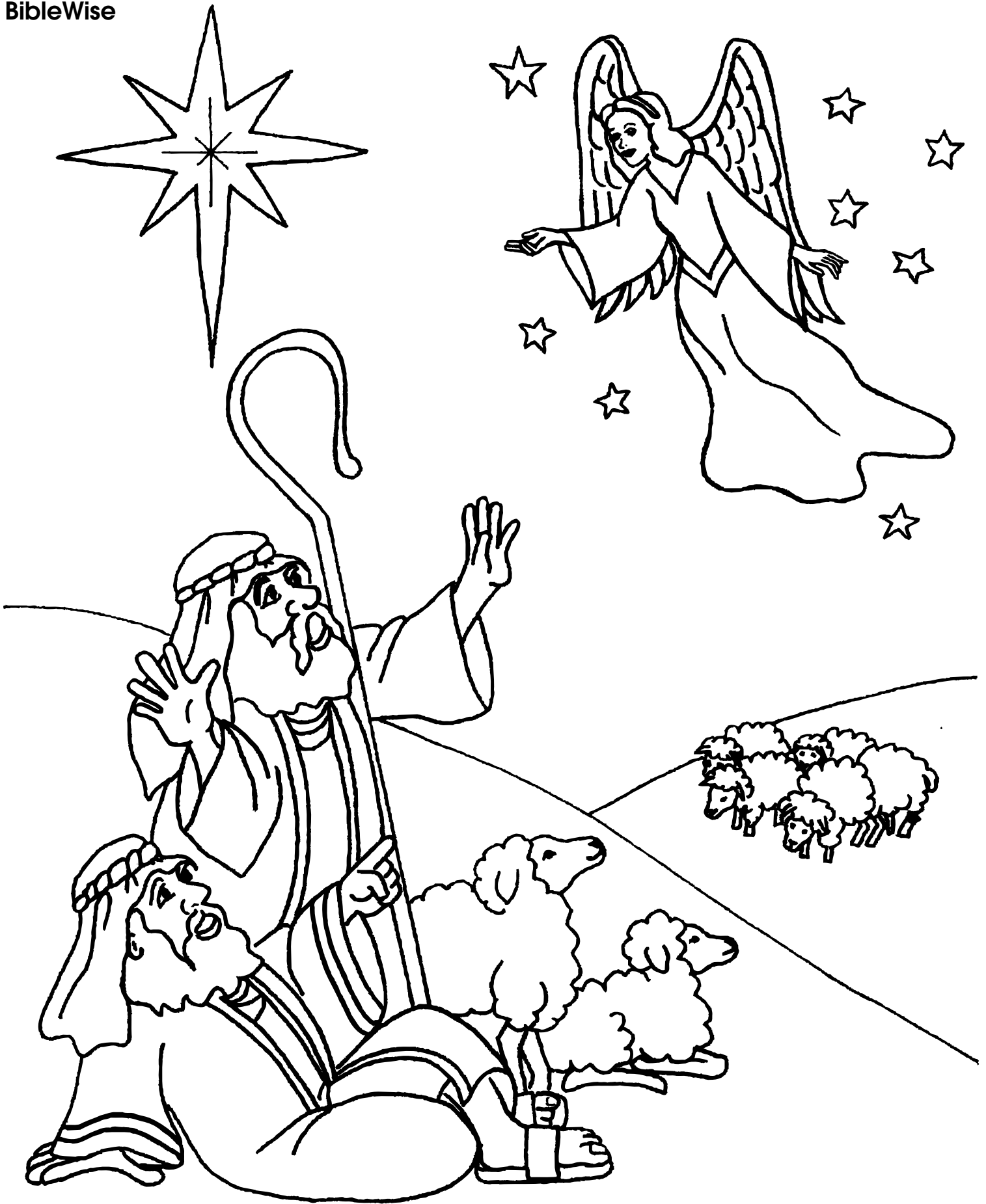
The Angel Telling the Shepherds the Good News